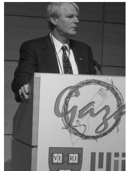
Congressman Brian Baird speaking at the Gaza symposium on March 30, 2009.

The symposium opened with an address from Congressman Brian Baird who, along with Congressman Keith Ellison (the first Muslim U.S. Congressman in history), were the first U.S. government officials to set foot in Gaza in three and a half years. Congressman Baird stressed the need for more expanded, immediate aid into Gaza, with a focus on quality rather than quantity. For instance, Baird noted that the Israeli administration was not allowing in extraordinary things (lentils, tomato paste, macaroni, and toothpaste) as they were considered a “luxury.” To Baird, the issue was not the specific items, but the message being sent by saying that Gazans cannot have these commodities. He pushed the audience to move beyond the false dichotomy of “if you criticize the actions taken by Israel in Gaza, you condone rocket attacks on Sderot” (which he condemns). In reality, Baird argued that one can criticize both acts and recognize that there are many other options for dealing with them.