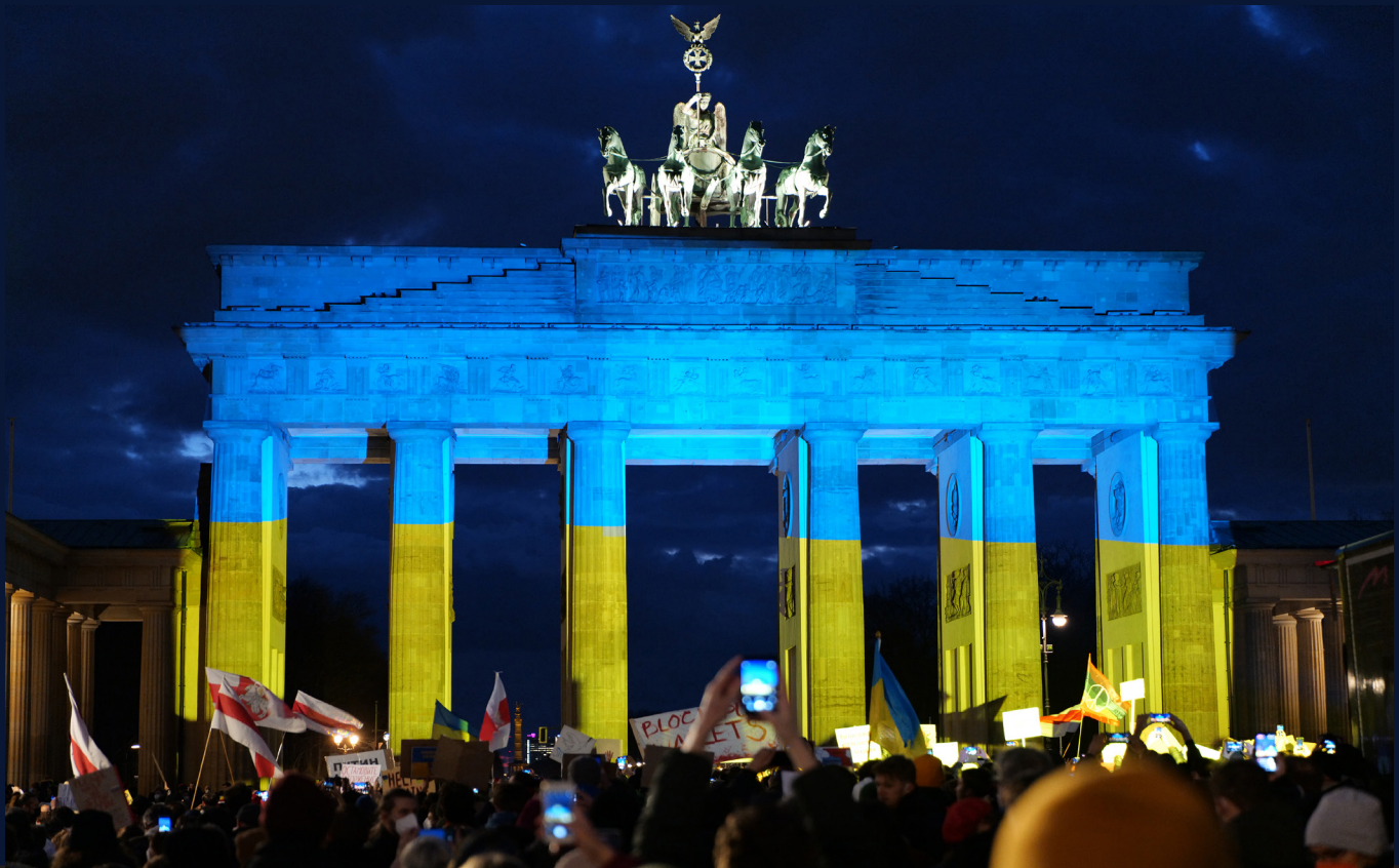
Ukraine solidarity protest on February 24, 2022, at Berlin Pariser Platz with lighted Brandenburg Gate.

In its first days, Russia's military invasion of Ukraine in late February has been met with substantial resistance. It has also created civilian casualties, a refugee crisis, a global movement to sanction Russia, and intense concern among observers around the world.